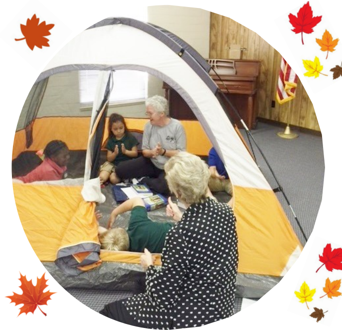
KFG learn about the Feast of Tabernacles in Deuteronomy 16.

Grief never ends... but it changes. It's a passage, not a place to stay. Grief is not a sign of weakness, nor a lack of faith.... It is the price of love.