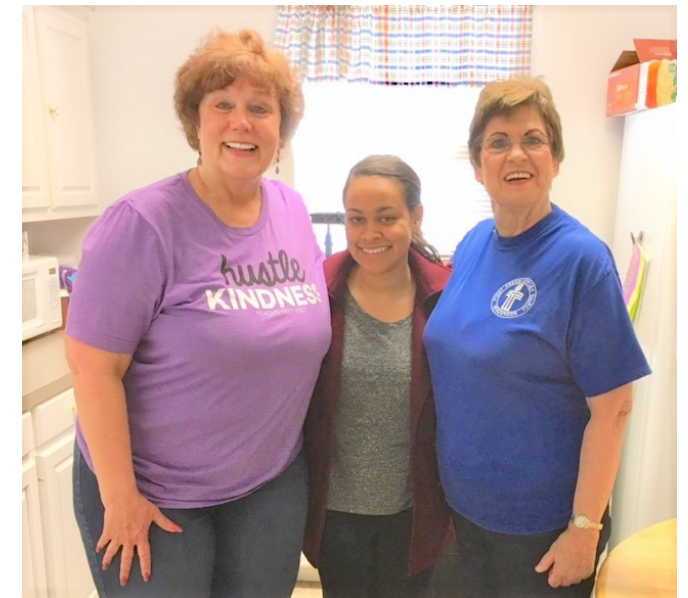
Presbyterian Hustlers hustling kindness by providing lunch for the March meeting of the Rusk County Children's Advocacy Board.