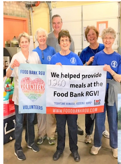
McAlLEN MISSION TRIP