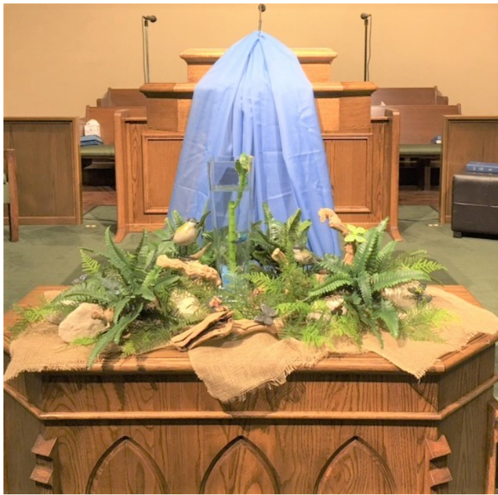
Bach the Betta fish in Earth Sunday display