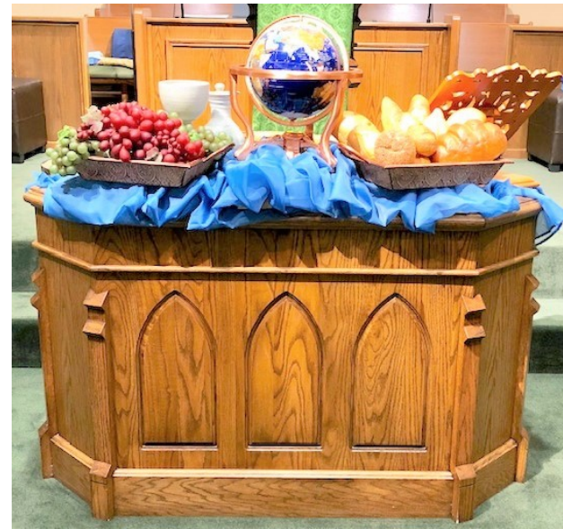
World Communion Sunday