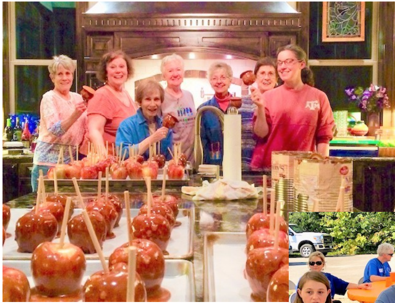
Preparing caramel apples for the Neighborhood Fall Reception on Oct. 27