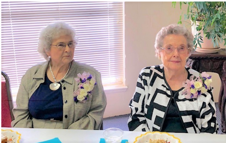
A special birthday celebration on Oct. 28 for two very special people!