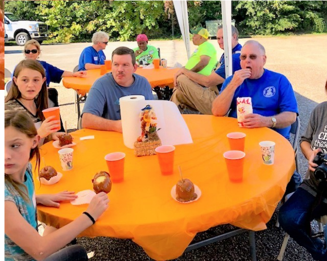
Neighbors enjoying caramel apples