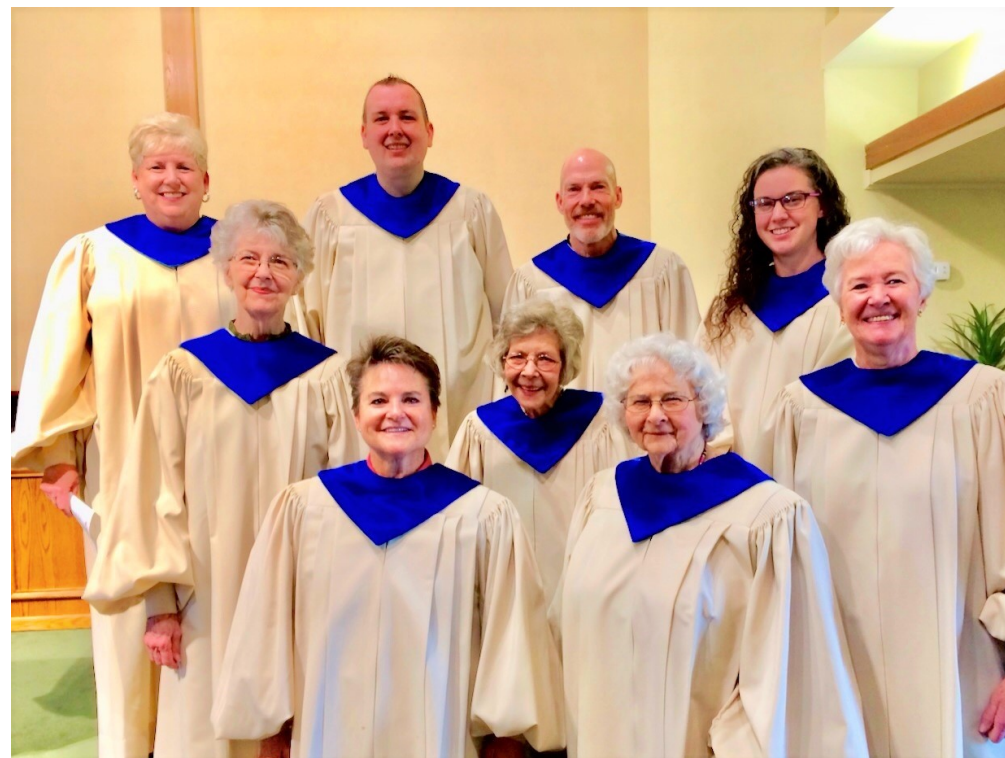
Beautiful service of Lessons and Carols on December 23rd