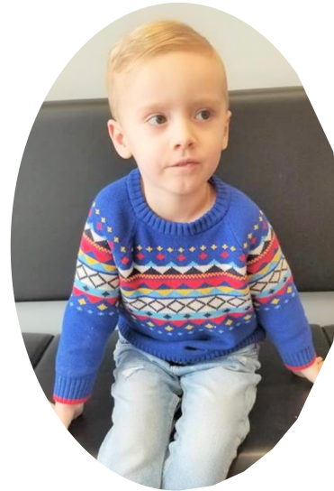
Our bell ringer's new haircut