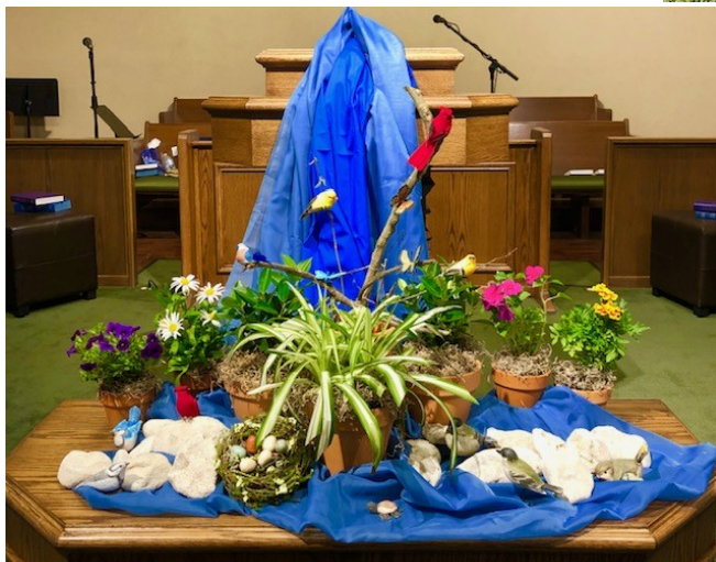
Earth Day Sunday Service was held on April 28th.