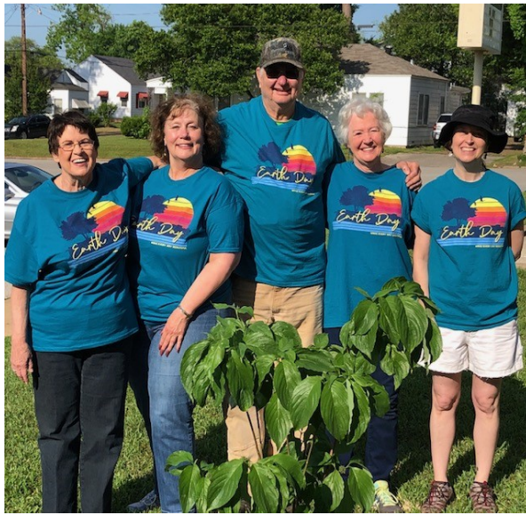
FPC Green Team observes Earth Day with a brief prayer service and planting a tree.