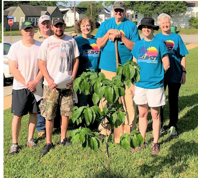
Building team joined with the Green Team for a short Earth Day Prayer service before starting on Work Day