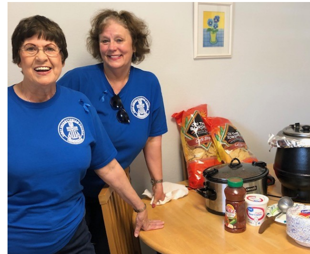
Members of the Mission team delivering food for the Rusk County Children's Advocacy Board meeting.