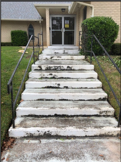
Building & Grounds team worked hard to get the steps of the church refreshed with a new look.