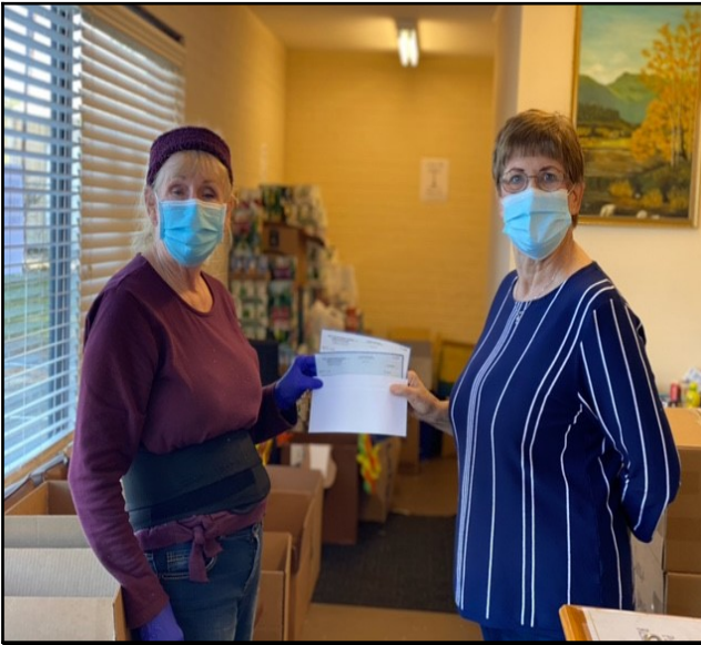
We, at FPC, are blessed to be a blessing for Henderson Interchurch Ministry.