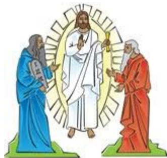
TRANSFIGURATION of the Lord