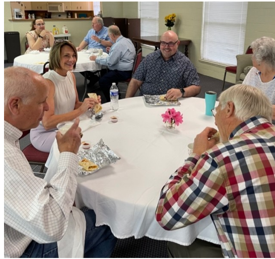
Easter Morning Breakfast