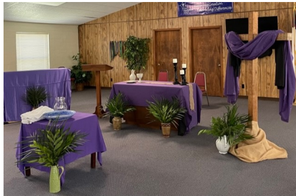
Maundy Thursday/Good Friday

Piglet noticed that even though he had a very small heart, it could hold a rather large amount of Gratitude.