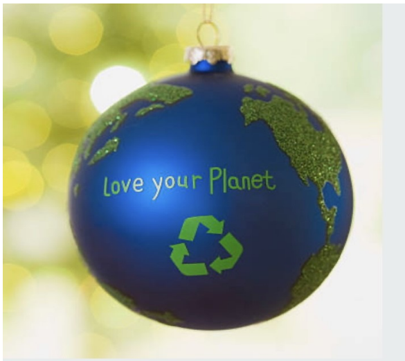
CE Green Team