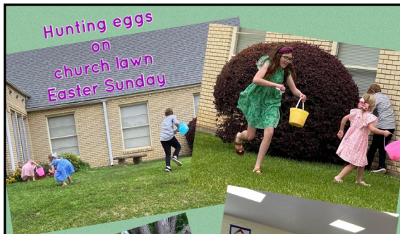
Hunting eggs on church lawn Easter Sunday