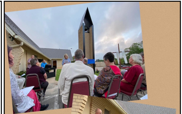
Easter Sunrise Service