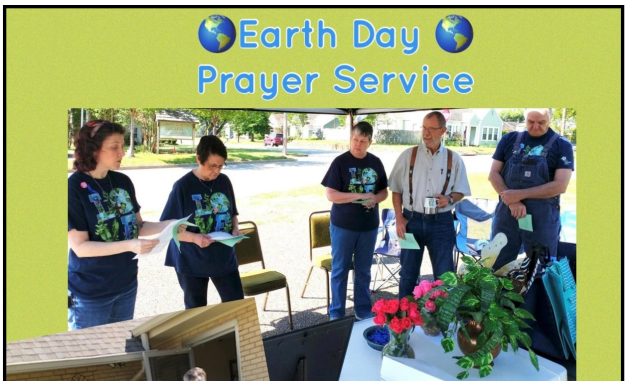
Earth Day Prayer Service